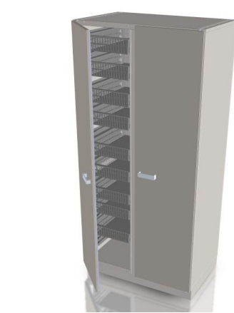
Double-section ISO Modular Cabinet